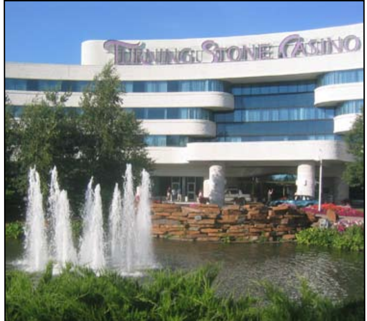
Turning Stone Resort & Casino

project scope: CLOWARD H 2 O provided design and engineering services for numerous site water features and fountains for the most recent addition to the resort. These include interior waterfalls, fountains and pools as well as exterior ponds, fountains and a steam fountain.